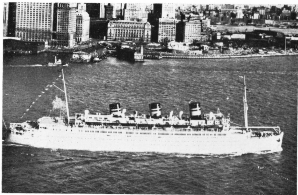
Fig. 1. Queen of Bermuda .

R.N. petty officers, six reservists and R.N.V.R. petty officers. The ship had a complement of 450 men—"altogether a very good lot", said Captain Hawkins. 4