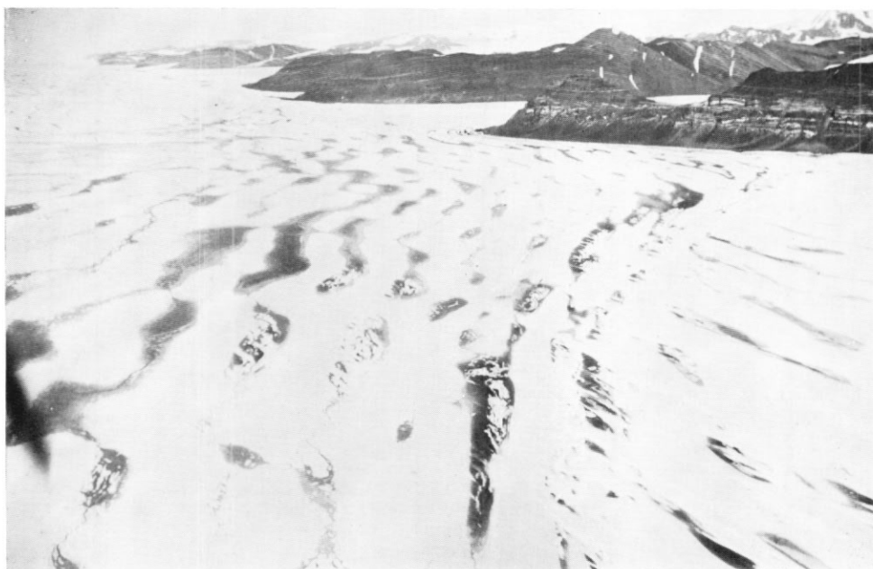
Fig. 2. Part of the flooded area of the ice shelf in George VI Sound.

The remaining possible causes of flooding are a decrease of surface albedo caused by debris wind-blown from the exposed rock at the margins of the ice shelf and transfer of heat by moving air from adjacent sun-warmed rocks (Solopov, 1967, p. 20). The latter involves two separate heat-transfer processes, first from warm rock to cold air, and secondly, from warm air to cold snow. Neither of these exchanges will be efficient, and so the additional heat supplied to the snow must be small. Radiation heating may, on the other hand, provide much additional heat. Megahan and others (1970, p. 76) found that dark powder spread on the snow surface in concentrations as low as 10^{-3} kg./m. 2 increased absorbed radiation by 50 per cent. With higher