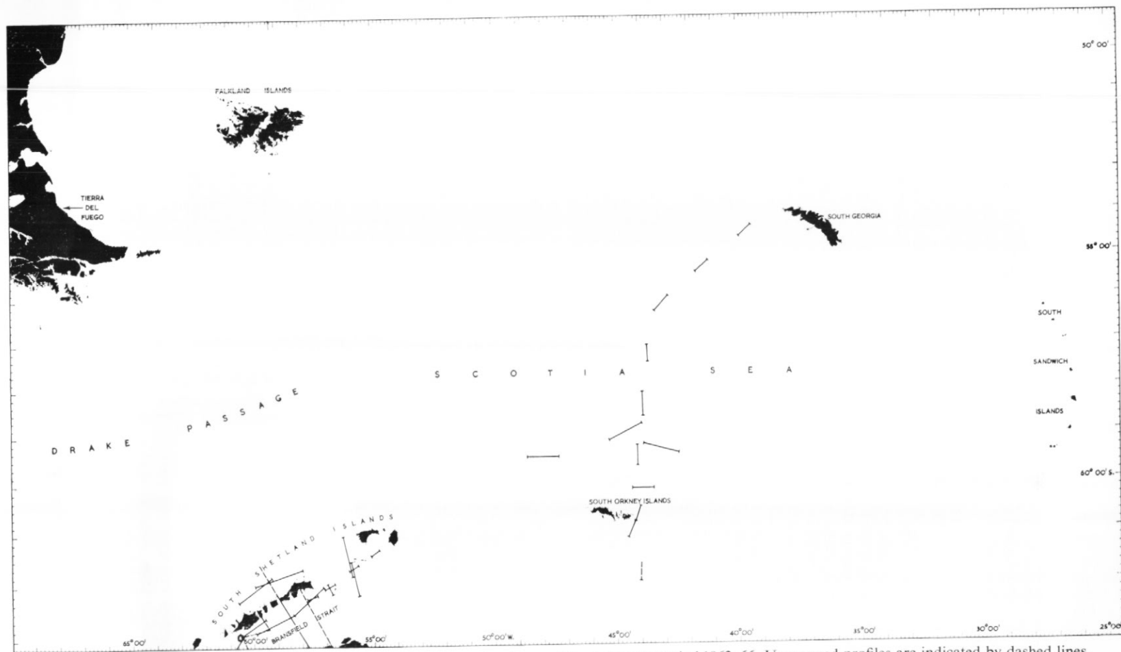
Fig. 3. Map of Drake Passage and the Scotia Sea, showing seismic refraction profiles shot in the period 1962-66. Unreversed profiles are indicated by dashed lines.